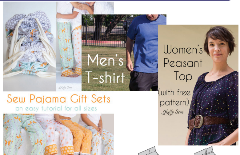
Sew Pajama Gift Sets an easy tutorial for all sizes

Most Recent Monthly Pageviews: 518,715 Unique Monthly Visitors: 243,475 3 Month Average Monthly Pageviews: 469,642 I also reach over 21,800 Facebook fans (across 2 pages), 23,900 newsletters subscribers 16,900 followers on Pinterest 4100 Instagram followers